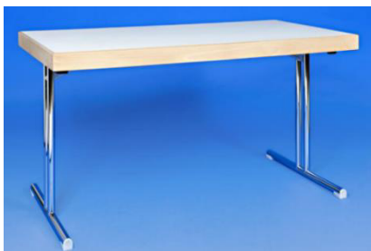
Table L 140 cm x B 70 cm

Available equipment (illustration exemplary):