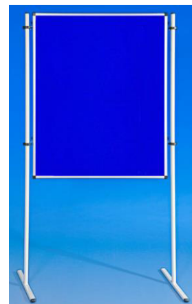
Pinboard or movable board H 145 cm x B 119 cm